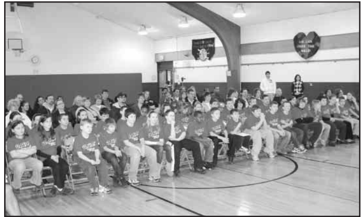
Fifth grade students and their guests listen intently during the Southwest D.A.R.E. culmination ceremony.