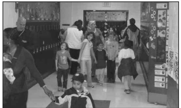
Some Northeast students and their families look for clues and count bunnies during our Open House and Scavenger Hunt