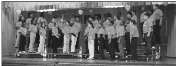
The Northeast 5th grade students perform the DARE song.