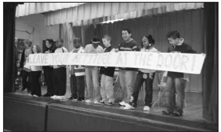
Some of Northeast's 6th grade students were re-teaching the Cool Tools at an assembly. This group was working on "Leave Your Attitude At The Door"

This has been a very successful year to this point. We look forward to a fantastic finish, with all of our students working hard and doing their best!