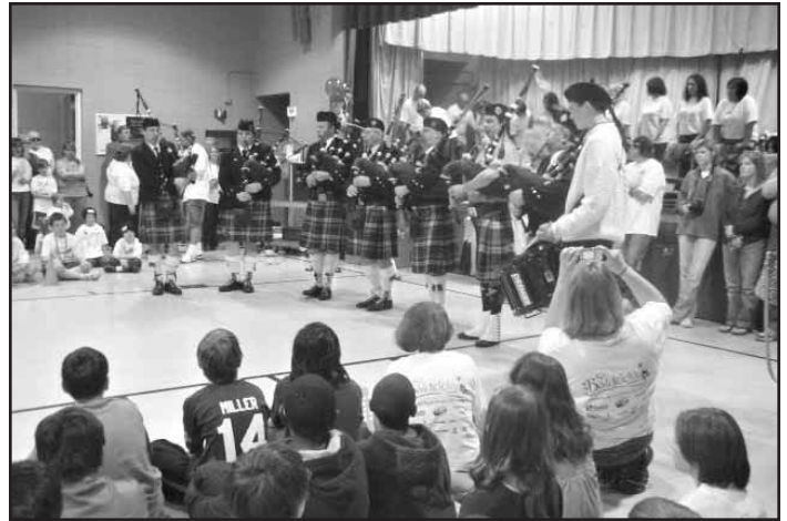
The Stockyard Kitty Band performs for Northwest School on St. Baldrick's Day.

discourage the participants. Much to our surprise and delight, our efforts have raised over $19,000.00 in online donations! The slogan of the Fox Schools Challenge certainly encompasses all of the efforts that Northwest School has undertaken this year, which is "Together we can make a difference!"