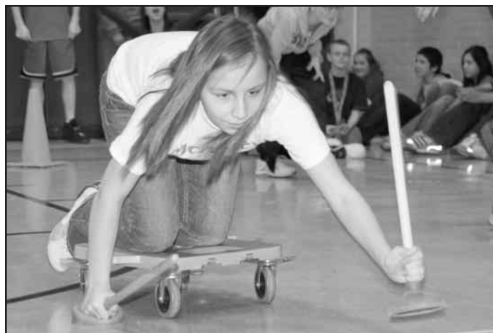
The Panther Challenge

As you can see, Central is the place to be!!!!!!!