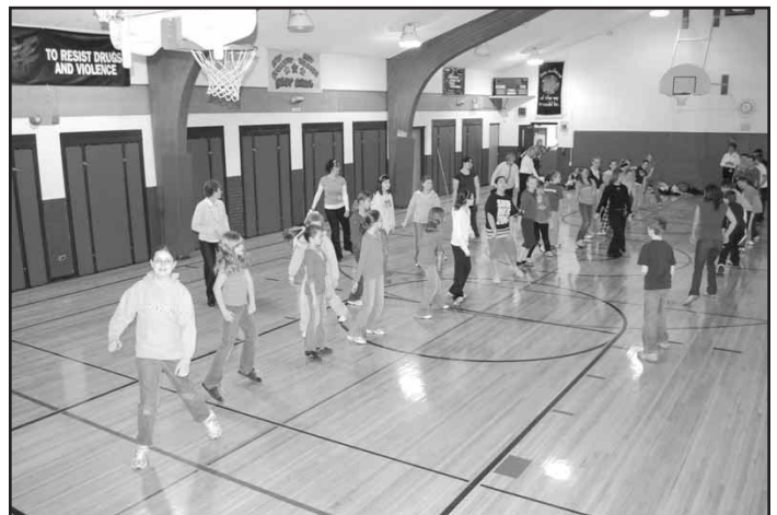
Bulldog Boogiers: Sixth grade students and teachers enjoy “boogie”ing to their favorite tunes.