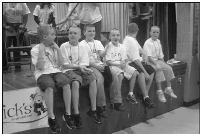
5th grade students (and yes, there is a girl there!) enjoy the St. Baldrick's Day activities after having their heads shaved.